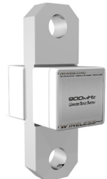
Wireless Tension Link