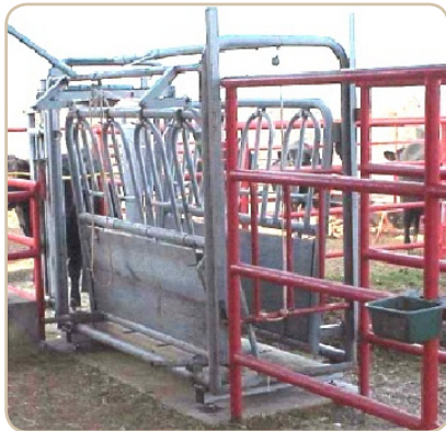
Loadbeams being used under a cattle squeeze